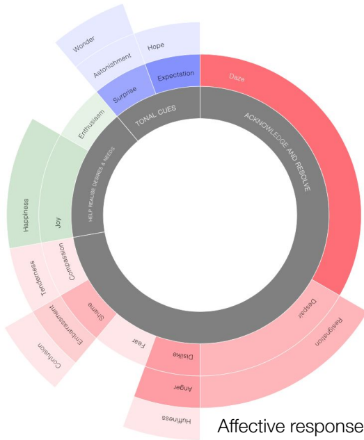
Affective response in NZ to Judith Collins: 16 August

The Nationals need to overcome a consistently 'dazed' populace with respect to the party and her new leadership. The delay in the election gives the Nationals extra time to overcome this hurdle.