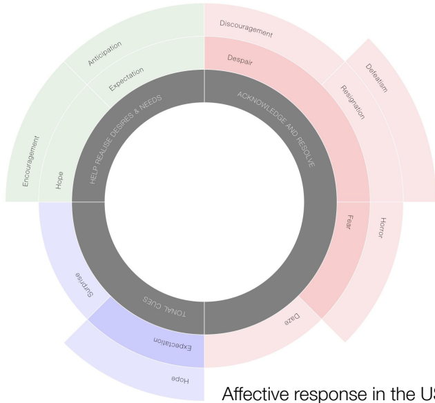
Affective response in the US to ESG investing: 24 August

Interestingly, BLM-focussed Investing has rapidly established itself as being of comparable importance, but with far greater momentum.